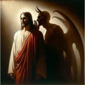
MARANATHA FAITH TEMPLE

27 My sheep hear my voice, and I know them, and they follow me: